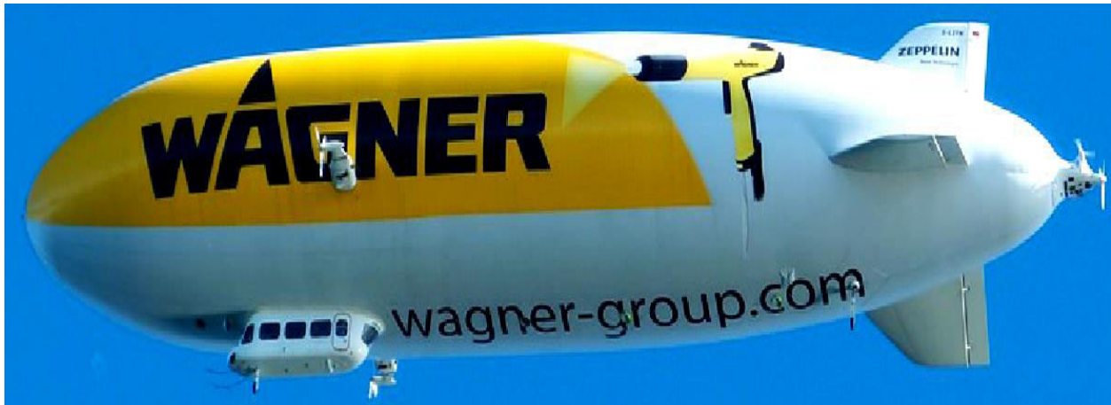
Figure 1. An example of the use of airships.

The possibilities of using airships are extremely high. They can be used for tourist purposes, research purposes, as well as for advertising (Figure 1). They were also used in military operations. These aircrafts can offer extremely high comfort to passengers. For example, the Hindenburg airship owned: a big dining room, a passenger lounge with carefully designed furniture and a piano, a writing room, 34 passenger cabins for sleeping, male and female toilets, a shower, promenades with seating areas and large windows which could be opened in flight, a smoking room, a bar, etc.