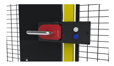
Figure 3. Electromagnetic lock with a call button.

Figure 3 shows an electromagnetic lock with call buttons and LED indication.