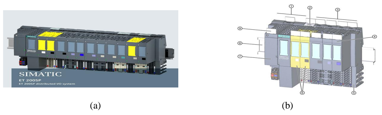
Figure 4. Siemens contoler ET 200 SP.

The PLC consists of the following components: 1. Interface module, 2. Network connection panel, 3. Voltage distribution by modules, 4. Input/output module, 5. Server module, 6. Safety input/output module, 7. Bus adapter, 8. DIN rail for PLC installation.