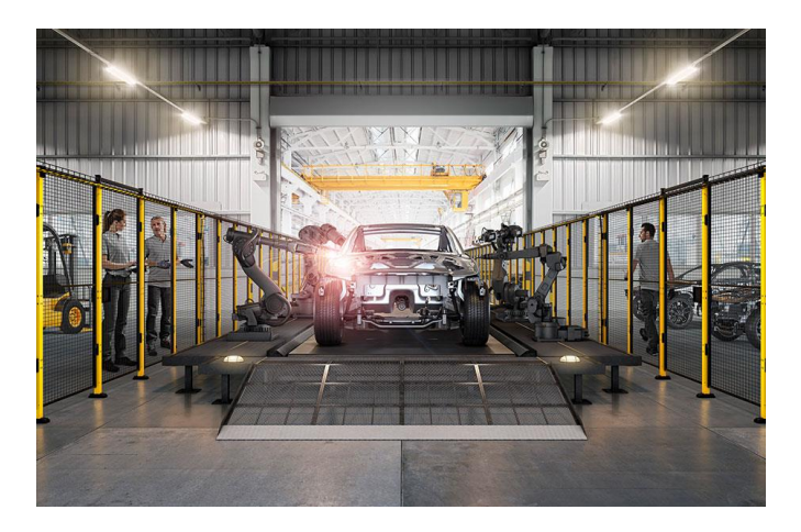
Figure 1. Use of Protective barriers on robotic production lines in the automotive industry.

2022, Volume 6, Issue 2, 1-9, DOI 10.6723/TERP.202212_6(2).0001